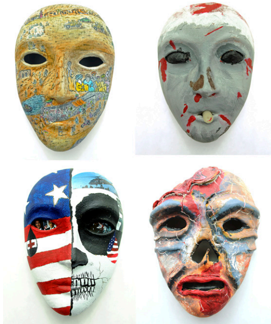
Military service members at NICoE at Walter Reed National Military Medical Center use masks to express the hidden wounds of war.